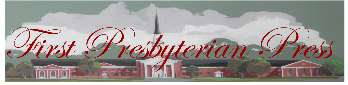
First Presbyterian Church Goldsboro, North Carolina