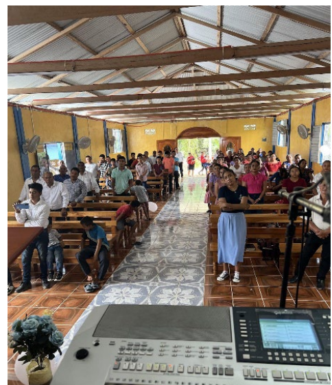
Church Service in 2024