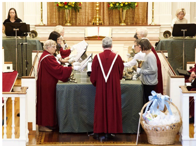
October 13: FPC Handbell Choir

Come & hear our own Chancel Choir plus guest singers, our Chancel Bells, guest organists, and string quintet in this beautiful worship service for the Christmas season.