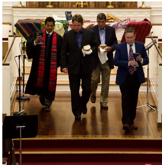
October 6: World Communion Sunday