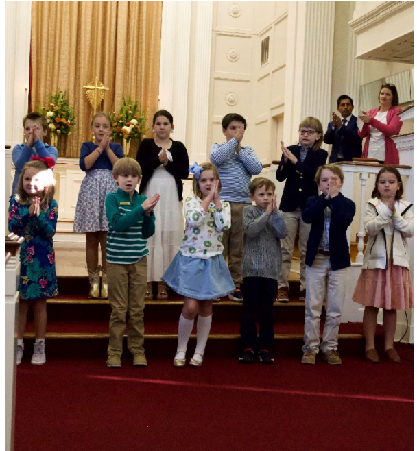
October 20: Children's Sunday

VBS 2025 June 16–June 20 9:00 a.m.–12:00 Noon