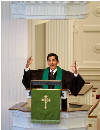
October 13: Pastor Appreciation Sunday

Location: FPC, McChesney Hall. Childcare will be provided upon prior request.